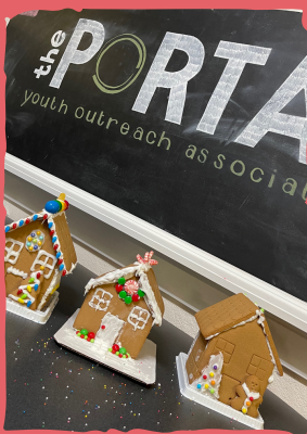
Gingerbread House decorating was held at The Portal for the youth