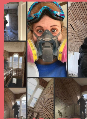
Some youth participated in a service project doing demo work